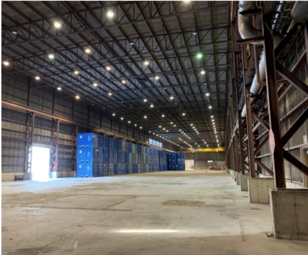
Main warehouse storage area