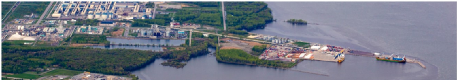
NEAS Bécancour Marine Terminal