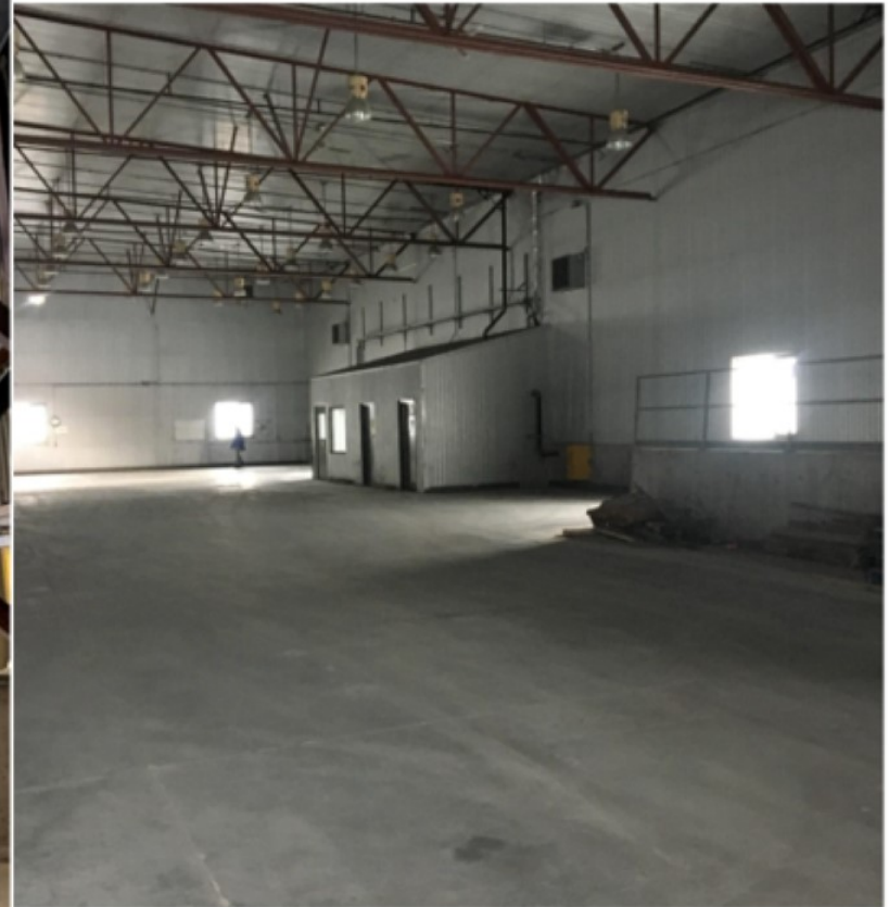
Heated storage area for temperature sensitive cargo